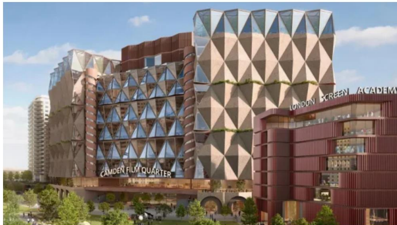
Camden council said the development would “transform an underused area”

Oxygen Studios will operate the major new film-making centre in north London, helping to position Britain as a blockbuster alternative to Hollywood